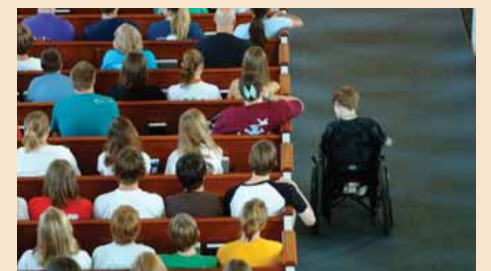
Students in the U.S.