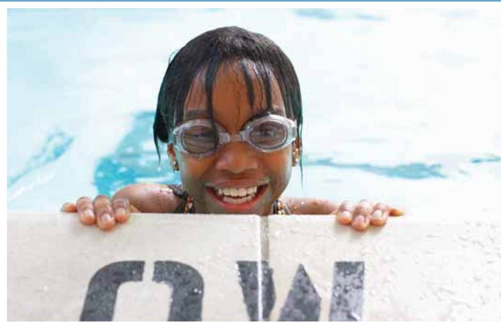
However, Camp is just around the corner! So get ready!