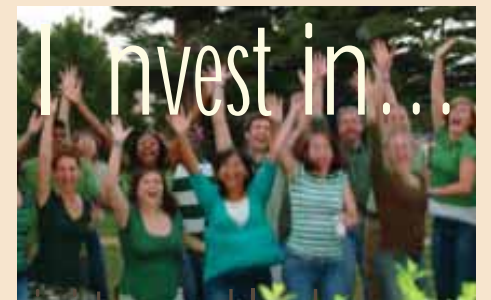
Future ministers and leaders