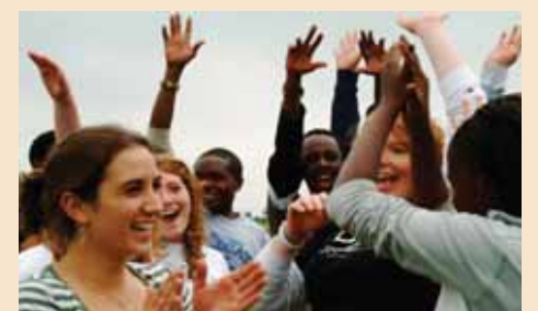
Students around the world.