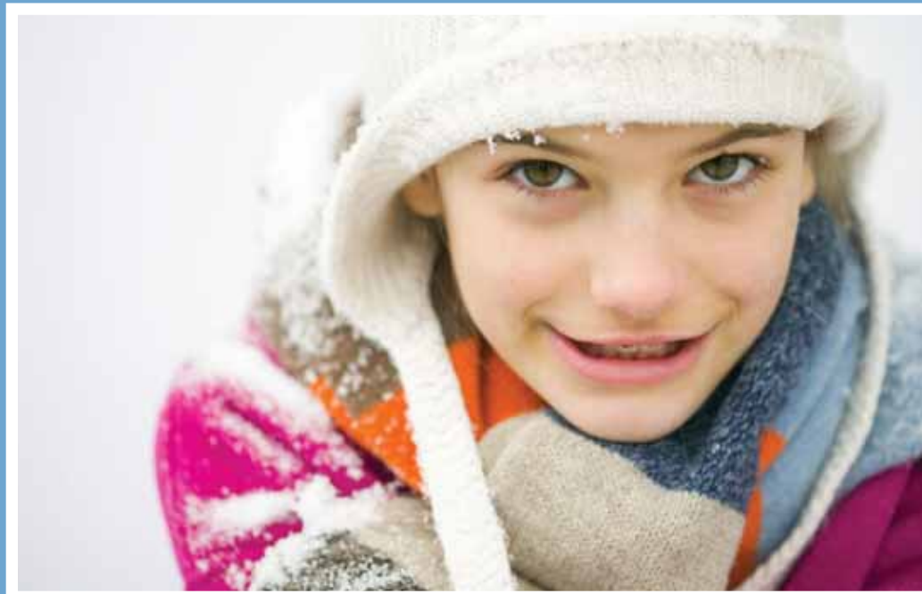
With the chill in the air, camp might be hard to imagine.